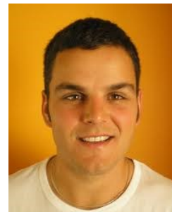
Table Tennis Australia released a statement regarding Houston's appointment, which can be viewed here: http://tabletennis.org.au/News/scott-houston-appointed-rio-team-leader-402618

Houston will have big shoes to fill as South Australian icon Paul Langley held the same position for the 2008 and 2012 Olympic Games. A third successive South Australian appointment to this vital Olympic role speaks highly for table tennis in the state.