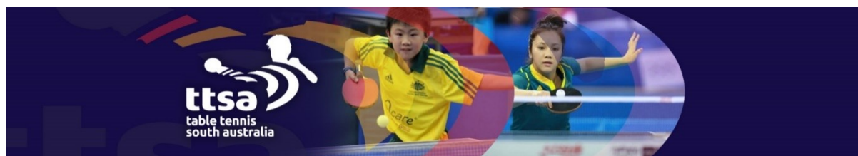
Table Tennis South Australia